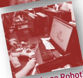
CAD & Lego Robotics