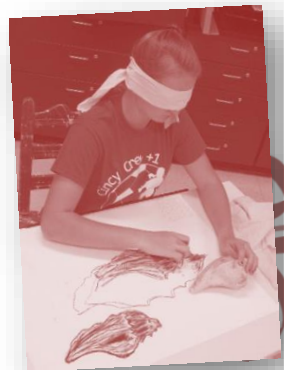
Media Arts Design