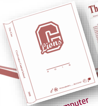
Computer Publications Year Book