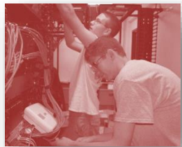
Computer Work Study