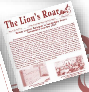
Computer Publications School Newspaper