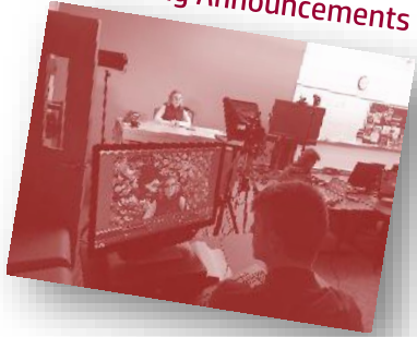
Digital Video Morning Announcements